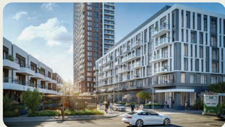
DANIELS MPV IN PARTNERSHIP WITH CHOICE PROPERTIES

Our promise that you will “love where you live” is weaved into every aspect of our communities, starting with careful thought and consideration at every stage of the design and development of each community we build. When you own a new home with Daniels, you can expect that your home was built with the highest level of attention to detail and following our all-inclusive approach that ensures excellence in construction quality and superior customer service from the day you purchase, to occupancy and beyond.