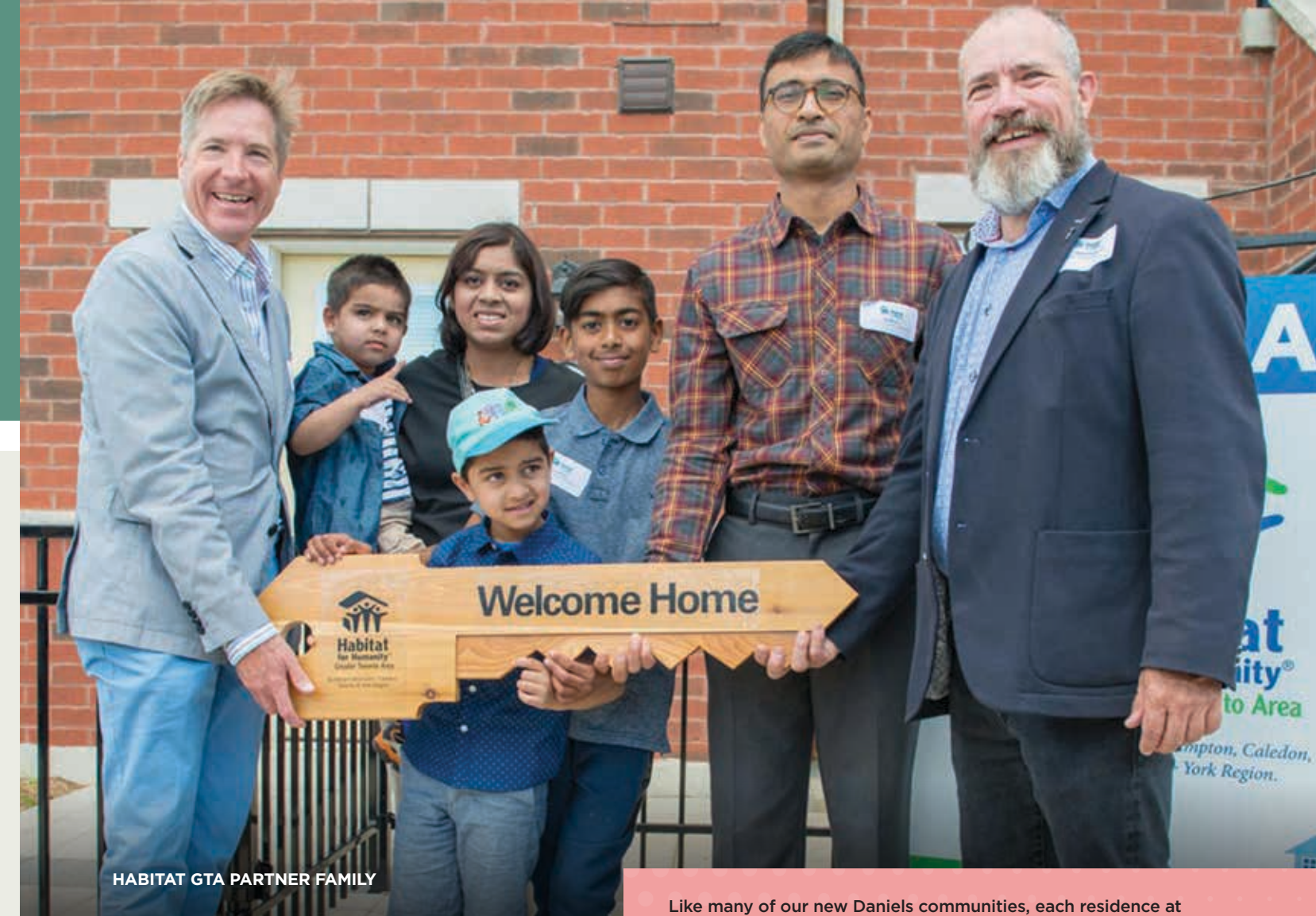
Like many of our new Daniels communities, each residence at OMG 2 will include a home for a Habitat for Humanity Partner Family.