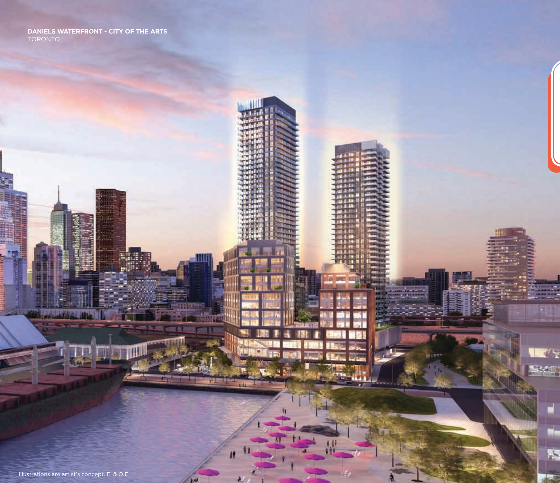
Illustrations are artist's concept. E. & O.E.

Weaving arts & culture into the community fabric