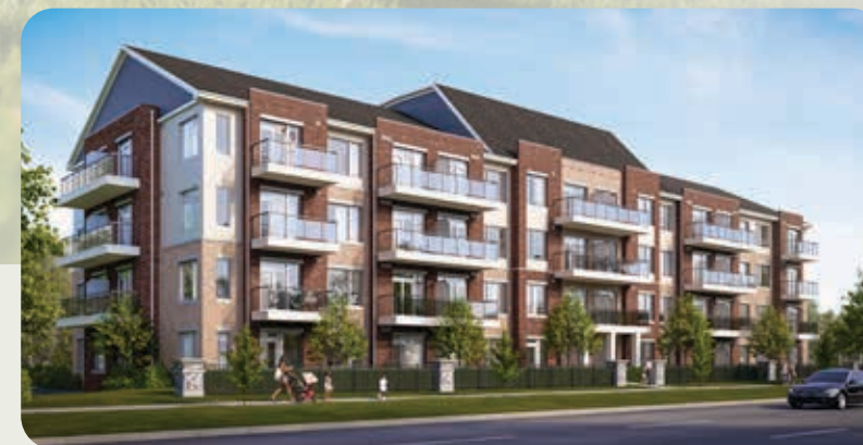
DANIELS OLIVIA MARIE GARDENS PHASE 1