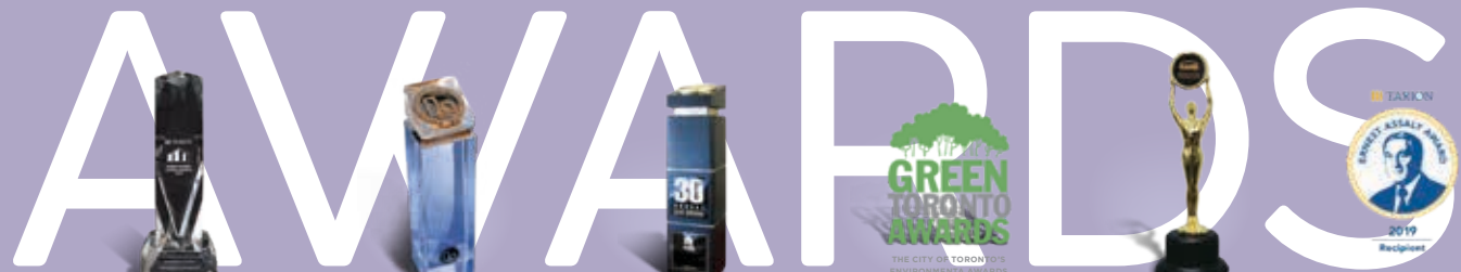
FOUR-TIME WINNER OF THE TARIION HIGH-RISE BUILDER OF THE YEAR AWARD

On the commercial end of the spectrum, Daniels creates outstanding business opportunities for national brand companies as well as grassroots not-for-profit organizations. Over the past 38 years, Daniels has embraced financial and hands-on generosity toward a number of charities and non-profit organizations, including Second Harvest, Habitat for Humanity and Covenant House Toronto.