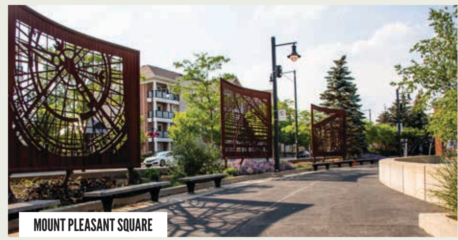
MOUNT PLEASANT SQUARE