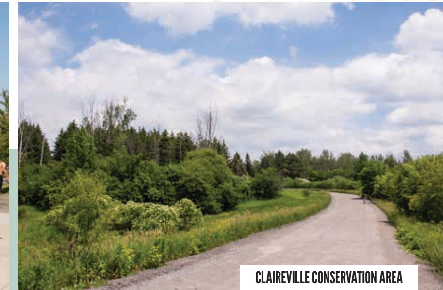
CLAIREVILLE CONSERVATION AREA