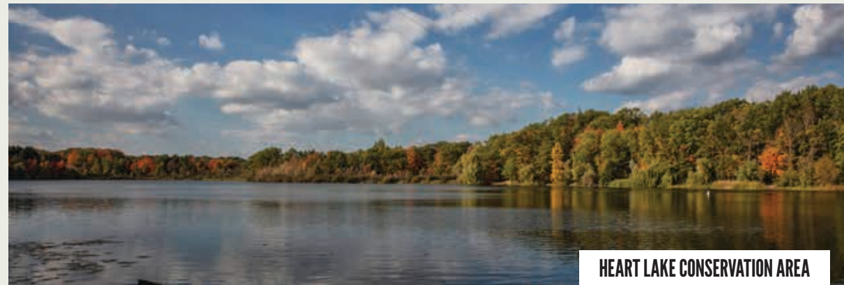
HEART LAKE CONSERVATION AREA

Living at OMG 2 means being connected to it all, including an exciting downtown infused with urban energy and an incredible level of choice for dining and retail. Bram West is quickly evolving into a destination rich in economic opportunity and innovation with many top tech and pharmaceutical companies located nearby.