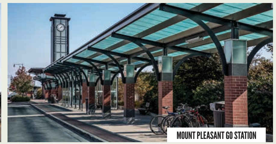
MOUNT PLEASANT GO STATION