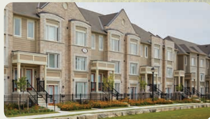
DANIELS FIRSHOME™ BECKENROSE