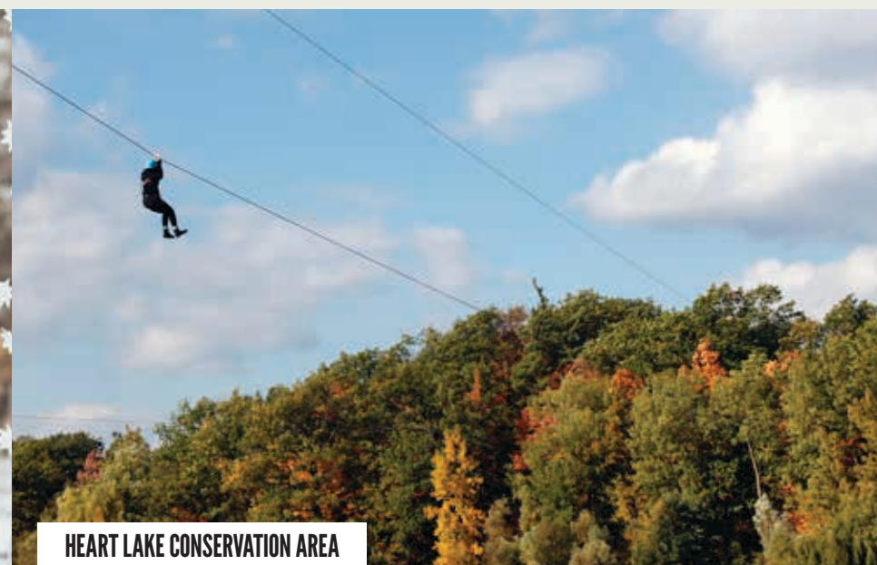
HEART LAKE CONSERVATION AREA